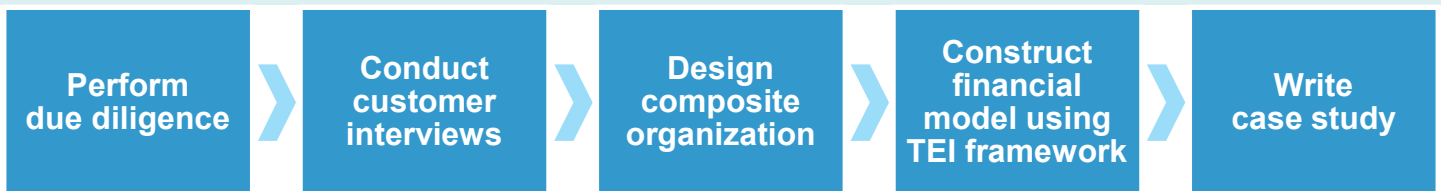
FIGURE 2 TEI Approach

Given the increasing sophistication that enterprises have regarding ROI analyses related to technology investments, Forrester's TEI methodology serves to provide a complete picture of the total economic impact of purchase decisions. Please see Appendix B for additional information on the TEI methodology.